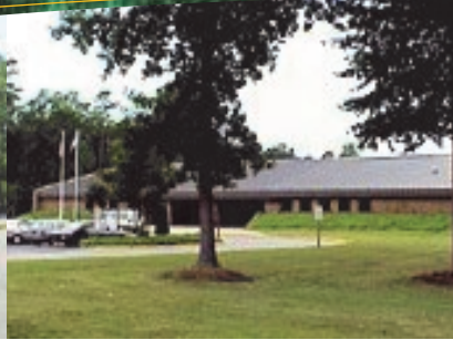
Hampton - Butler Farm Campus

13400 Woodside Lane Newport News, Virginia 23608 (757) 874-4444