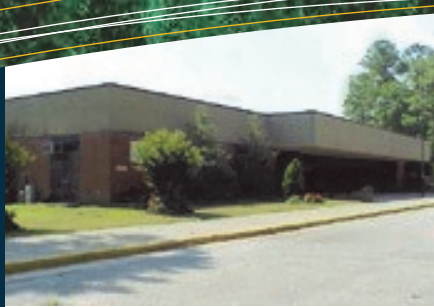
Newport News - Woodside Lane Campus

If you choose to drive to New Horizons, you must obtain a parking decal by September 24th. Protect your right to drive by obeying all the driving and parking regulations as well as the attendance policy. This also means you are expected to arrive in class on-time.