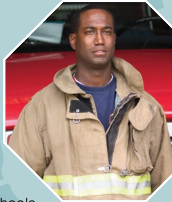
Fire Fighter $39,640

Students attend half-day at the Career and Technical Education Center and half-day at their home high schools.