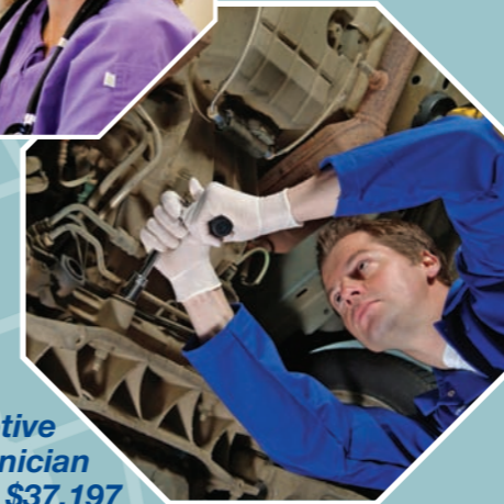
Automotive Technician $37,197

New Horizons Career and Technical Education Center developed our skills while creating job opportunities for us. At the same time, we received state certification and college credit. In short, New Horizons gave us a great jump start to our career futures.