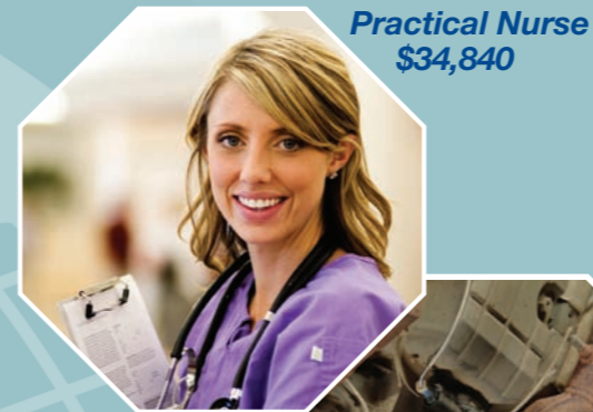
Practical Nurse $34,840