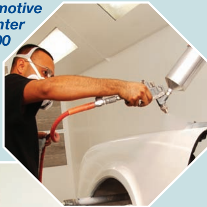
Automotive Painter $43,400