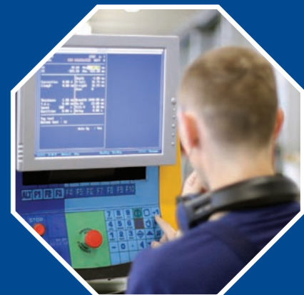
Machine Technician $34,790